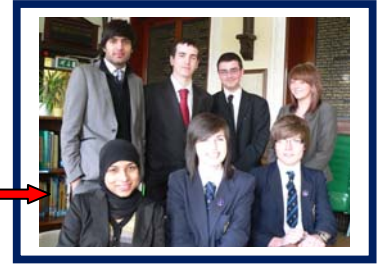
Events 2 Go Young Enterprise Company