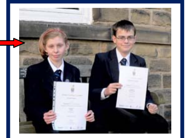
Distinction for these two musicians in their Associated Board exams