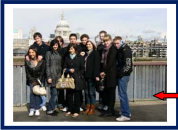
6th Form Classics visit to London