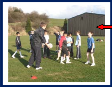
Football coaching in Priestley House